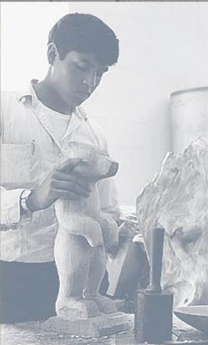
Each generation of Cherokee artists carries on tribal traditions, but also leaves its own imprint.