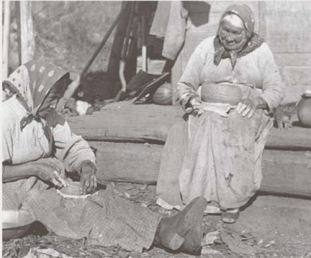
Caption relating to above photo will be in this area. Caption relating to above photo will be in this area.