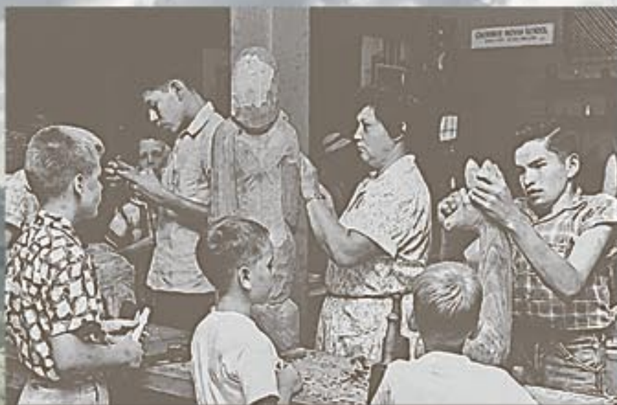
One of RTCAR's goals is to encourage projects that enable master artisans to teach Cherokee youths about their cultural heritage through learning experiences much like the one that took place in this carving class approximately 50 years ago.

Cherokee potters used to make their products from local clays, but today, they must often buy it from dealers in other states. Relocating traditional clay pits and identifying new local sources reinforces the relationship between the potter and the medium, infusing the final product with a sense of place.